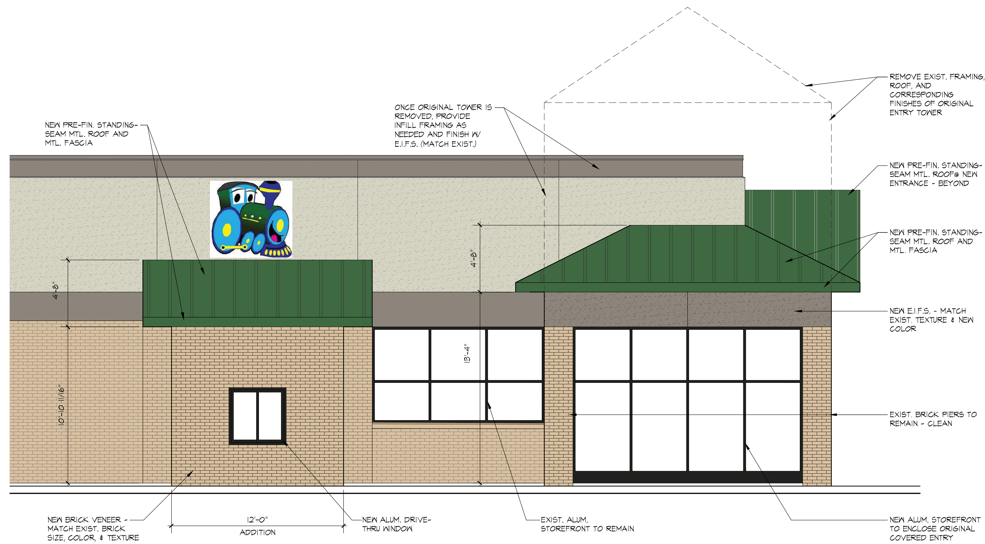
1 ENLARGED WEST ELEVATION SCALE 1/4" = 1'-0" FACING S. MAIN ST.