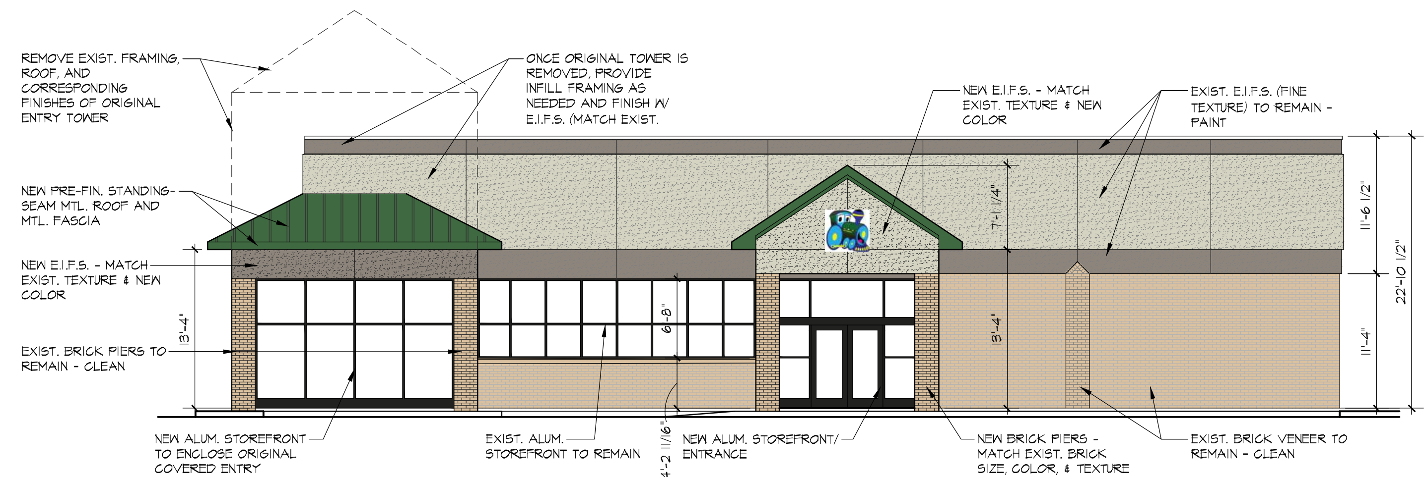
3 SOUTH ELEVATION A-4 SCALE 1/8" = 1'-0" ELEVATION FACING 619