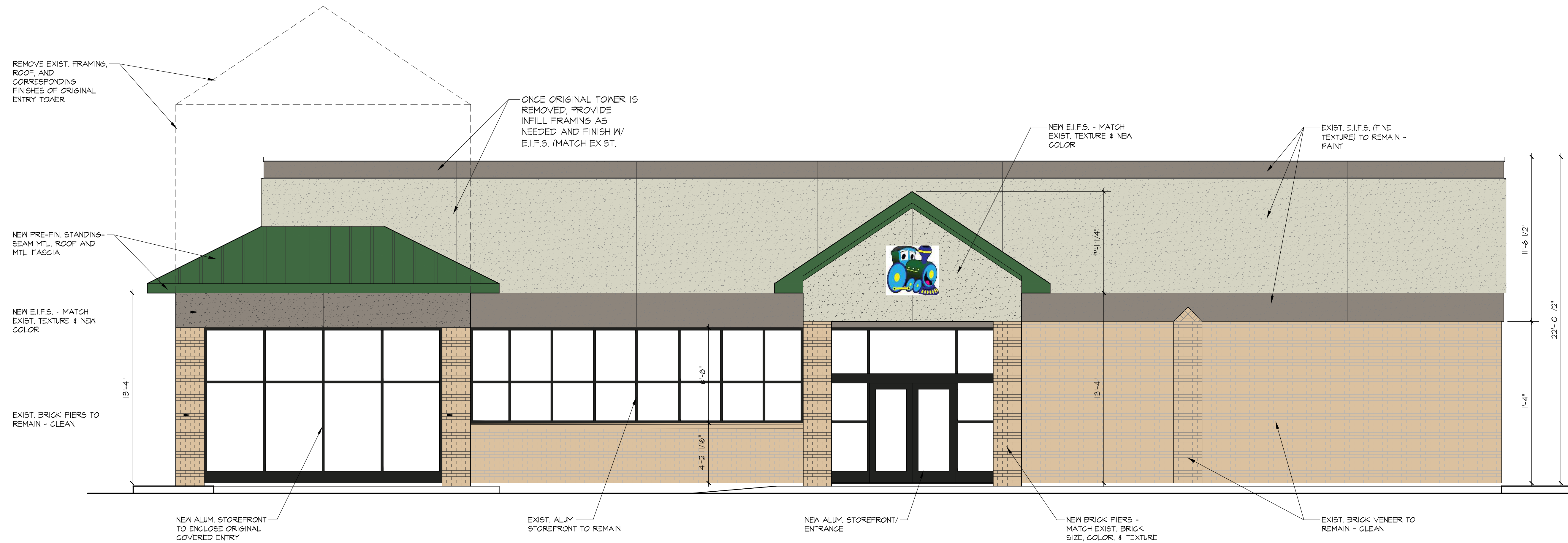
2 ENLARGED SOUTH ELEVATION SCALE 1/4" = 1'-0" FACING S. MAIN ST.